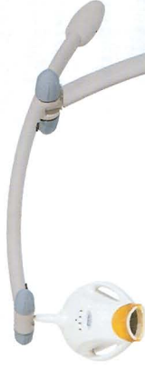
NEW Zoom!® Whitening Lamp

A: During the procedure, patients may comfortably watch television or listen to music. Individuals with a strong gag reflex or anxiety may have difficulty undergoing the entire procedure.